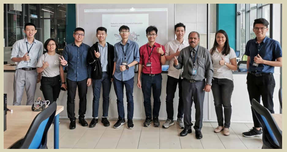
Group photo after the workshop