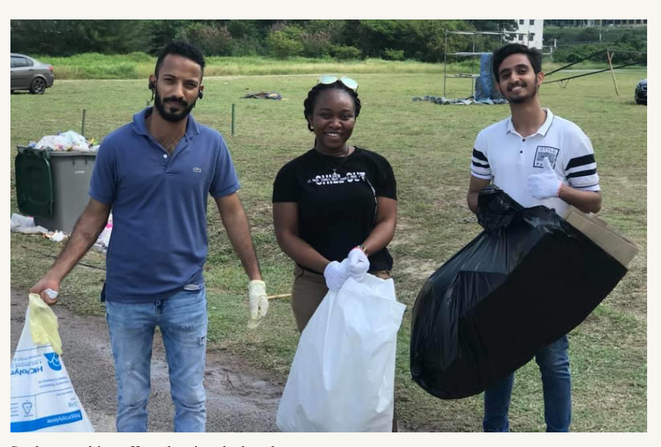
Students making effort cleaning the beach

seeing more beach cleaning activities being organized! Kudos to the School of Engineering for initiating this meaningful effort; they have perfectly demonstrated that apart from academic knowledge, the academia also plays an important role in shaping mindsets and developing great personalities.