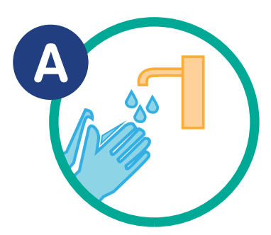
Regularly wash hands.

STUDENTS ARE STRONGLY ADVISED TO PRACTICE STANDARD PREVENTION MEASURES AND SOCIAL DISTANCING AT ALL TIMES.