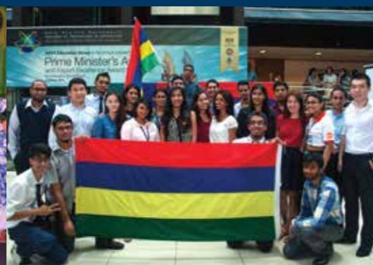
Mauritius Students Gathering