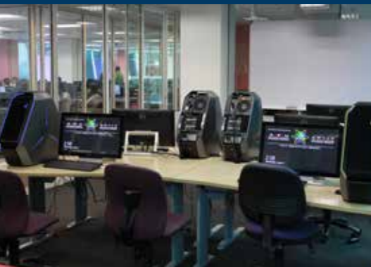
Games Development Labs