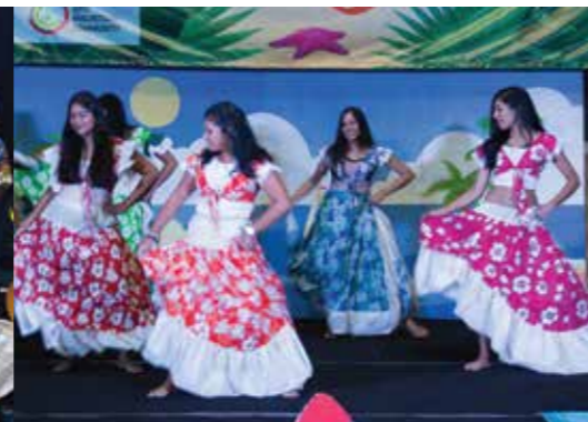
Island Night - 2016