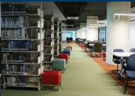
Information Resources Centre