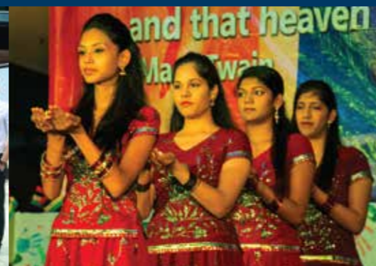
Mauritius Independence Day - 2014