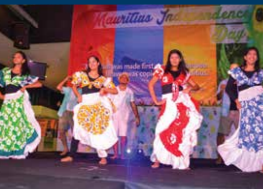
Mauritius Independence Day - 2015