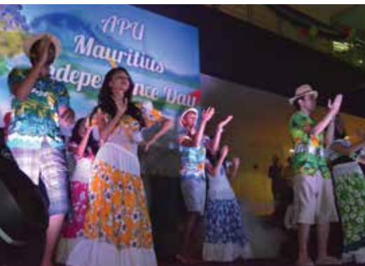
Mauritius Independence Day - 2016

"With more 100 students from Mauritius, APU has its own Mauritian Community. The main purpose of having the community is to ensure that the mauritian students 'feel home away from home'. The Mauritian Community organises annually the celebration of the Mauritius independence day @ APU. It also merges with other communities to organise multicultural events. Very often, gatherings will be organised to celebrate the different religious festivals and end of year get-togethers. In terms of recreational activities, the community members do frequently participate in Futsal, Taekwondo tournament to defend the country colours."