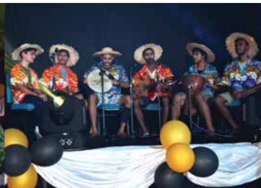
Multicultural Night - 2016